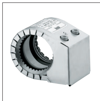
FGR Grip E-FP