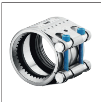
FGR COMBI GRIP E

NORMACONNECT® First-Aid Repair Clamp is part of a broad portfolio. Discover more!