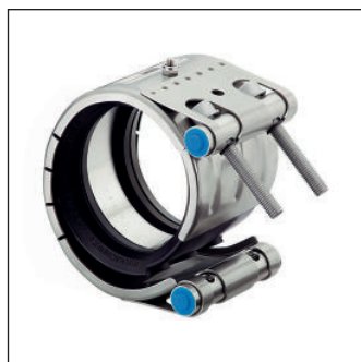
FGR REP E